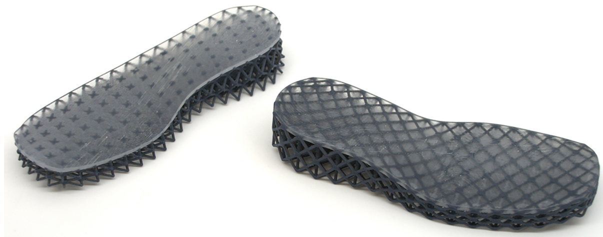
DManD researchers created multi-material soft-lattice structures for this footwear prototype using a custom design, analysis and slicer tools to spatially control stiffness and non-linear