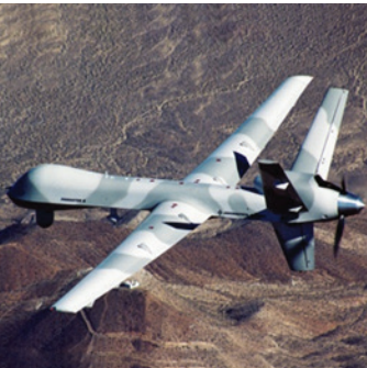
For the Department of Defense, the TDF designs and builds “trainers” and “training aids” such as UAV replicas to train students.

Based at Sheppard Air Force Base, Wichita Falls, Texas, the Trainer Development Flight (TDF) is a facility that designs, develops, and manufactures trainers and training aids for the Air Force and all branches of the Department of Defense (DoD) as required. These items are used in numerous training environments, including avionics, weapons and fuel systems, medical readiness, HVAC, and telecommunications systems.