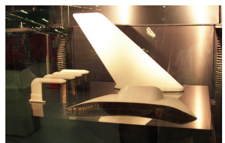
Antenna and other components being manufactured by a Fortus FDM machine.