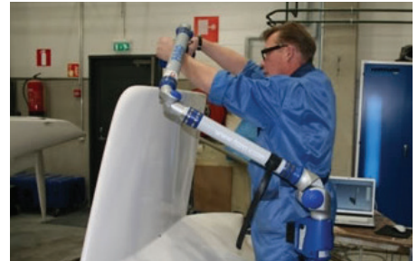
The TDF often reverse engineers components to make the replicas.