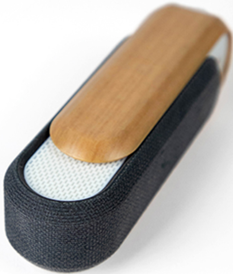
Speaker prototype 3D printed on the J55