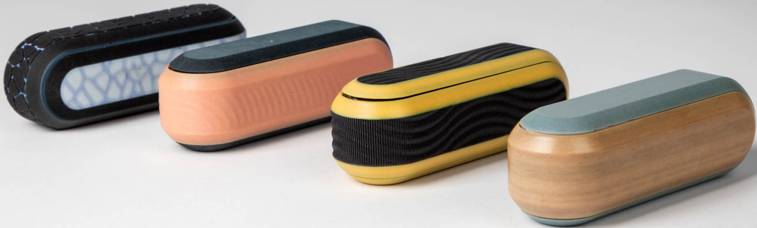
Early CMF explorations 3D printed on the J55

This workflow has major implications for how the team will approach future projects. Priority Designs uses KeyShot throughout the product design process – it offers a large material library and the renders help communicate ideas to clients. The ability to go from KeyShot render to 3D print with few steps in between saves time and makes it easier to create physical prototypes.