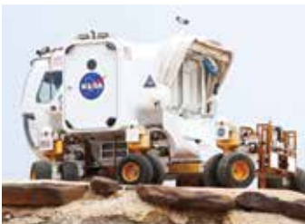
This rover, which has a pressurized cabin to support astronauts, includes about 70 FDM parts, including housings, vents and fixtures.

An agile white vehicle roams the Arizona desert, maneuvering the unforgiving terrain as the wind and sun beat down and temperatures swing from one extreme to another. NASA astronauts and engineers are test-driving a rover over rocks and sand, up and down hills in an environment that simulates the brutal conditions of Mars.