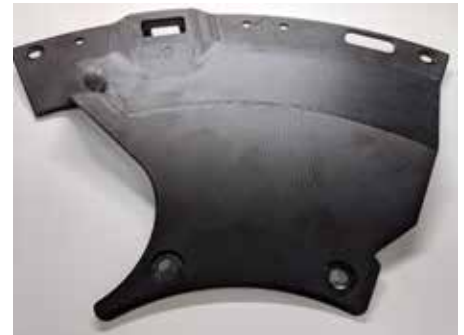
The electro static dissipative qualities of Antero™ (ESD) PEKK material make this part flight-worthy.

“So when Stratasys allowed us access to be a Beta customer for this new material, Antero™ (ESD), we got a material that’s strong and capable of being used as a structural polymer that has those ESD qualities that we were looking for,” said Kaplun. Antero (ESD) is a Stratasys PEKK-based high-performance polymer with low-outgassing properties and ESD capability. “We’ve been able to see orders of magnitude savings both in cost and schedule on all of these parts because the part builds are very consistent, the material properties are well understood, and the build parameters are becoming better understood.