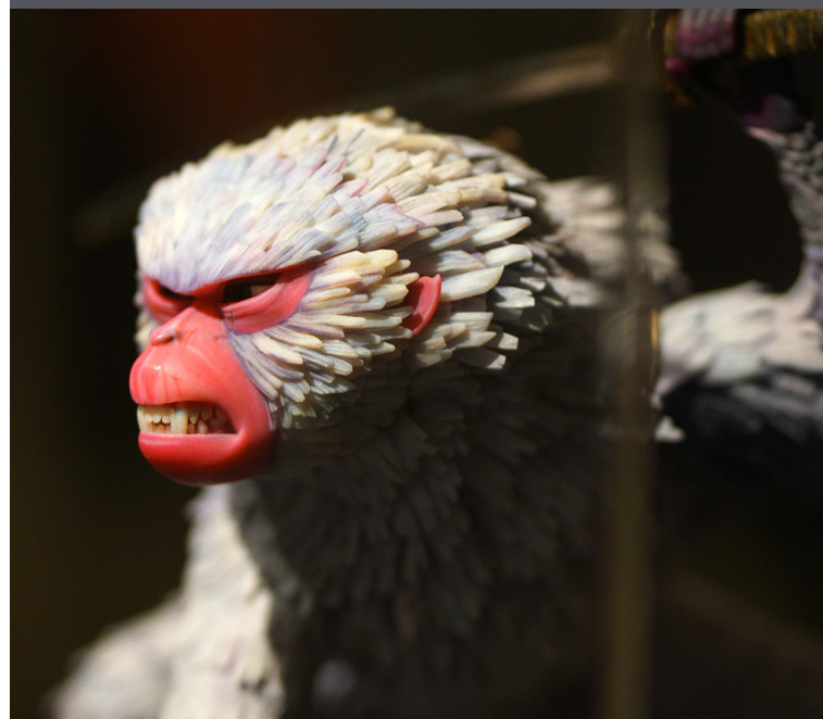
Monkey from "Kubo and the Two Strings," LAIKA's fourth feature film.