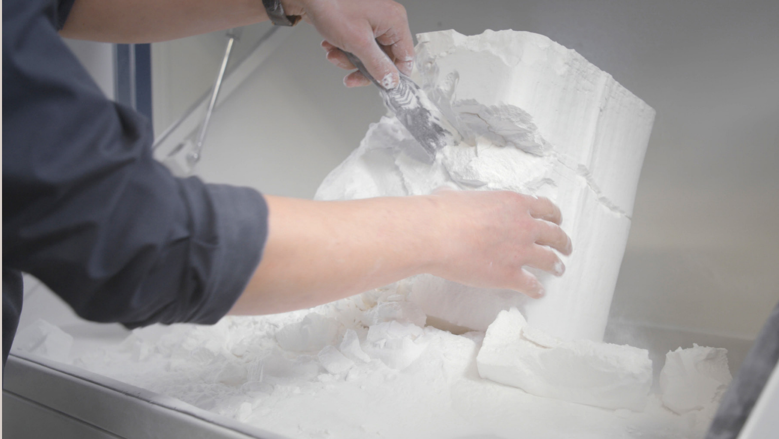
The H350 uses an infrared sensitive HAF™ to fuse particles of polymer powder together in layers to build parts

However, when it comes to producing volumes of up to several thousand parts, Goetz has been reliant upon traditional manufacturing methods like injection molding. While part quality is great, this has come at a cost to the business with mold production extremely costly and time-intensive.