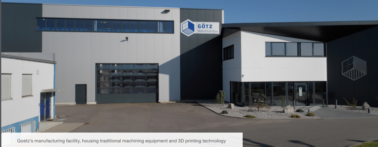
Goetz's manufacturing facility, housing traditional machining equipment and 3D printing technology