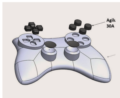
Figure 1: With the J Series, it only took a single five-hour print to produce a multimaterial controller prototype, with rigid VeroWhite™ for the body and rubberlike Agilus30™ for the buttons.

Using modular designs made it easy to test different colors and patterns, and because of the multimaterial capabilities, Shuvom could print several designs in different colors at once, which expedited the prototyping process. In fact, he was able to test so many different designs that Shuvom says he started running out of ideas.