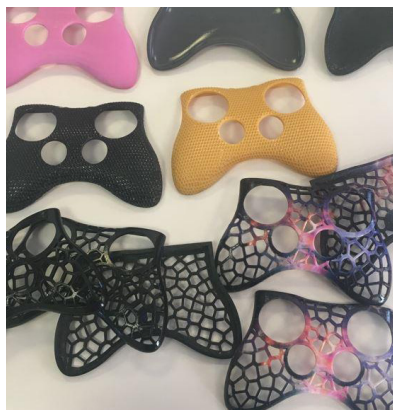
Figure 2: Shuvom created a dozen different colored models in just two days.