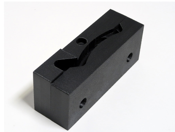
Soft jaws 3D printed in FDM Nylon 12CF carbon fiber material and the machined part these jaws hold during machining.