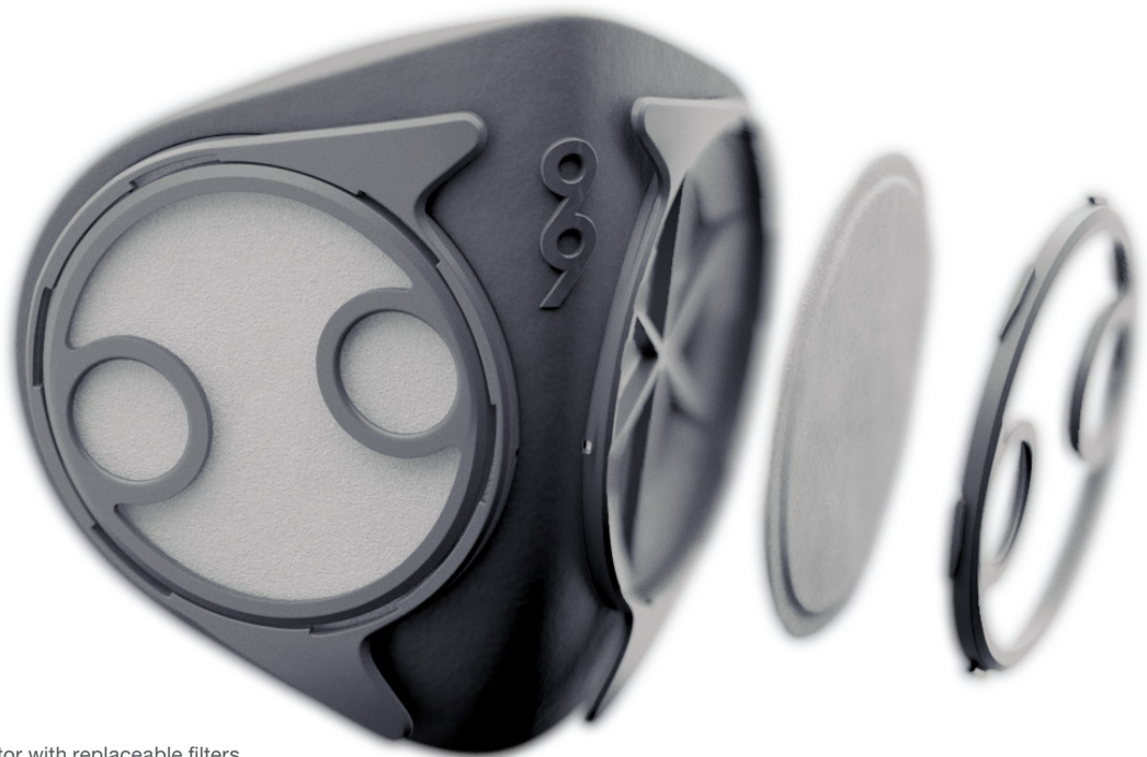
Breathe99 B2 respirator with replaceable filters.

The original respirator design – the B1 – was a good starting point, but needed several improvements to make it suitable for mitigating the spread of infectious disease. The new design incorporates elements of industrial respirators, such as two filtering elements and an ergonomic seal to ensure the only air flowing in and out goes through the filters. However, the B2 mask uses unique flat filters that help keep the design lightweight and wearable. The filters are also the only part of the mask that need to be replaced, which helps reduce ongoing costs and waste compared to alternative PPE options.