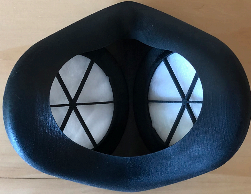
Multimaterial B2 respirator prototype 3D printed with Agilus30.