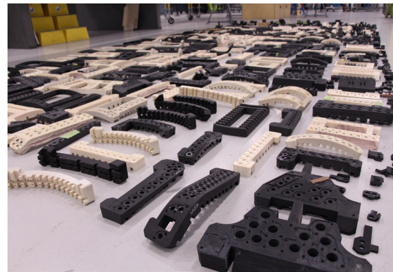
A sample of 3D printed drill guides used in the production of the XB-1 demonstrator aircraft.

Using just one typical drill guide as an example, Boom saved approximately $3,700 in material cost and reduced lead time from weeks to days. Considering that over 700 drill blocks have been 3D printed in the production of the XB-1 demonstrator aircraft so far, the material cost savings is significant. The lead time savings between in-house 3D printing and machining also has a substantial positive impact on the production schedule.