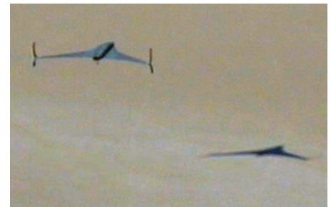
Inaugural flight of 3D printed jet aircraft.