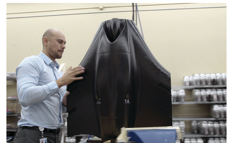
Stratasys and Aurora designed a complex structure that could be used for single-mission aircraft.