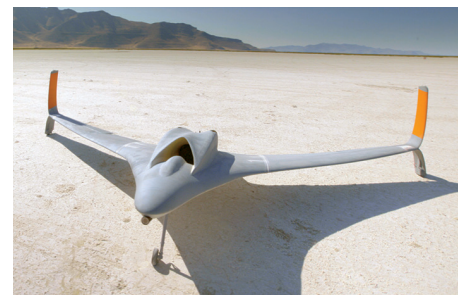
Final 3D printed jet-powered aircraft.